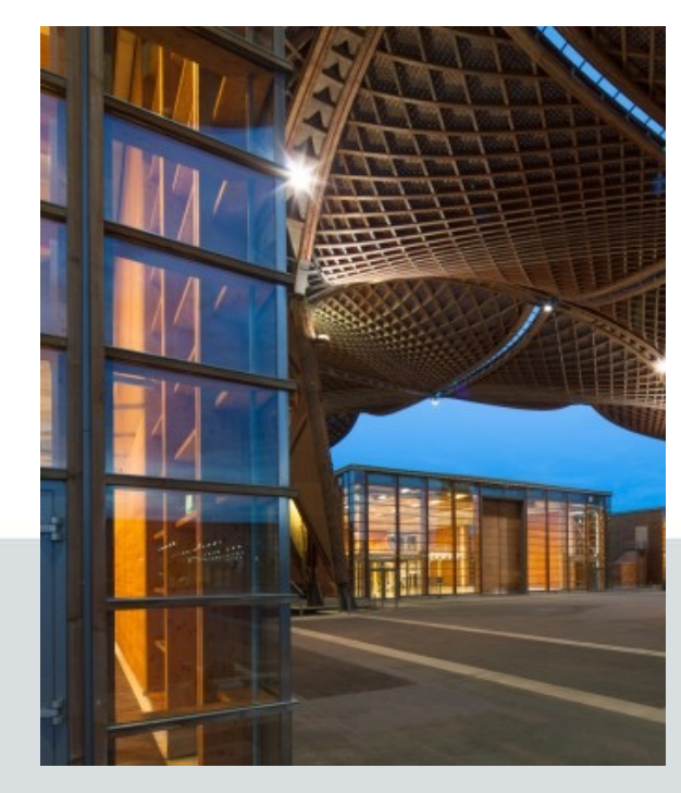
Event language: German